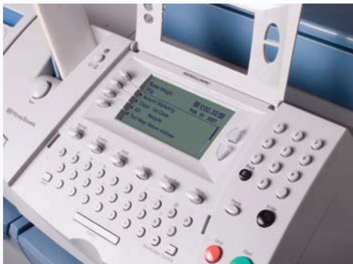
Easily add a custom text message with the qwerty keyboard