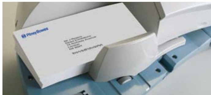
Automatic feeder quickly processes your mail